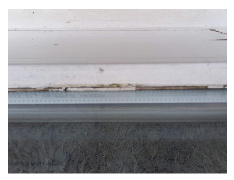
Badly manufactured casements on many windows with large gaps