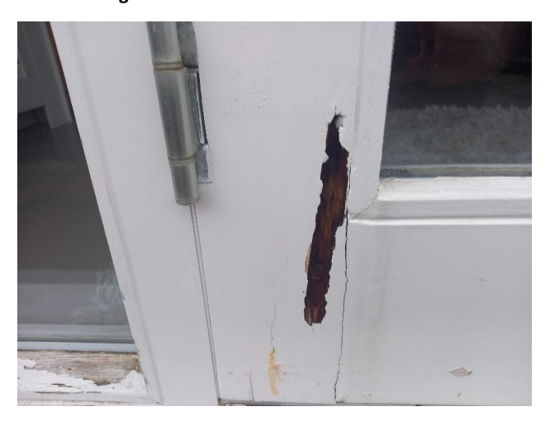
Peeling and exposed beading – damp wood and leaking

Significant Rot on the rear French doors.